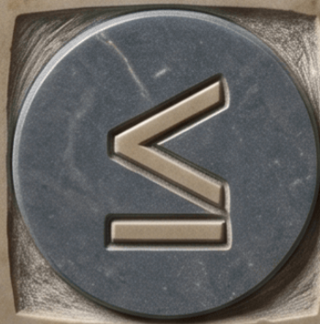
Less than or equal to