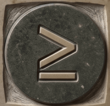
Greater than or equal to